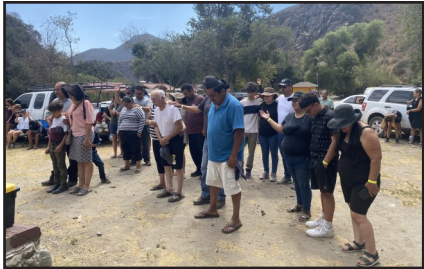
Praying beforehand with those that were going to be baptized.

https://app.box.com/s/xg42d6q9o06nn5fivvsbdf0rdvhd47ed